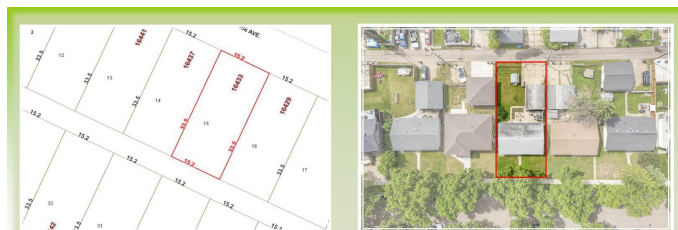
50' X 110' LOT ~ IN BRITANNIA