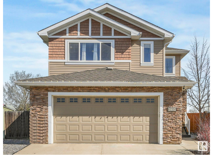
3910 49 Ave, Beaumont, AB

Welcome to this fully upgraded well constructed home in the Forest Heights neighborhood. Upper level with huge primary bedroom, walk-in closet, 5 pcs ensuite, jacuzzi tub and double sinks. 2 other spacious bedrooms, bonus room and laundry. Main floor office, 9 foot ceiling, kitchen with walk through pantry, quartz counter top, center island, plenty of cabinet and all stainless steel appliances. Separate entrance to the professionally finished basement with a FULL kitchen and separate laundry, gas fireplace and so much more. Pie sharp backyard with a views of the Colonial Golf Course. This is the essence of turn key ready. Exceptional value is being offered and is a must see!